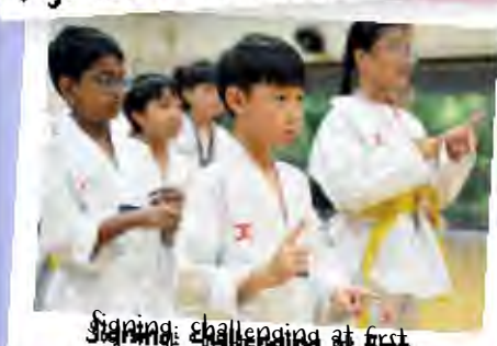
Signing: challenging at first, easier with practice