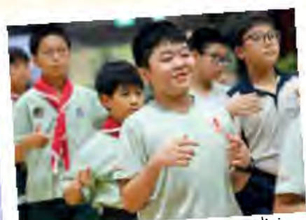
Regardless of race, language or religion