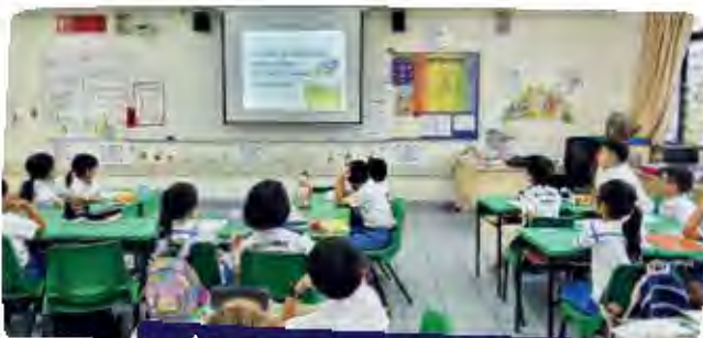
All eyes on our L1 details