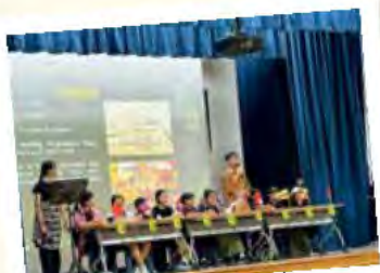
Regional traditions: diverse Hari Raya Celebrations!

The performance also introduced key information about ASEAN, including its emblem, the role of the 2026 ASEAN Chair — the Philippines — and examples of cooperation among member states. The skit was further enlivened by Hari Raya performances, bringing festive traditions to life. Through this experience, students learnt to appreciate diverse cultural practices while recognising shared values that unite communities across ASEAN.