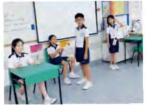
Dramatisation adds spice to learning

Moreover, students are exposed to a range of rich texts where they take an active, inquiring stance to reading to develop and deepen insights into the stories, characters, issues and worlds they encounter. Frindle by A. Clements is the selected text for Primary Four and Love that Dog by Sharon Creech is the chosen text for Primary 5. Primary 4 students attend weekly, one-hour sessions conducted after school, whilst RC sessions at Primary 5 are integrated into