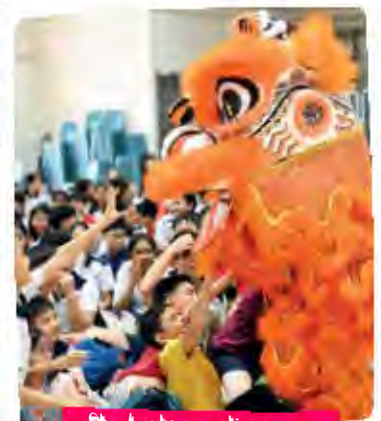
Students meeting our festive lions