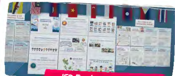
IFD Board - reflections from our Global School Community!

Beyond the assembly programme, students were encouraged to view the canteen noticeboards, which presented insightful information about IFD and ASEAN. These displays were complemented by reflections from our international teachers and students, who shared their experiences living in Singapore. These authentic voices allowed our