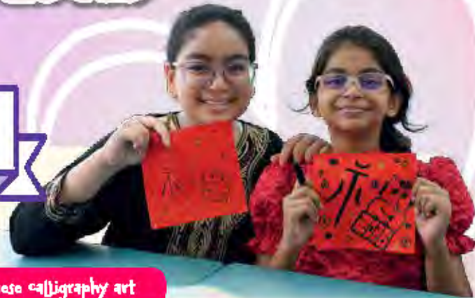
Chinese calligraphy art

Interactive activities further engaged students in festive learning. A school-wide Kahoot quiz conducted via Google Meet reinforced cultural knowledge in an enjoyable way, whilst classroom-based colouring and craft activities strengthened their understanding of festival symbols and meanings. Through these shared experiences, students collaborated actively and expressed themselves with confidence.