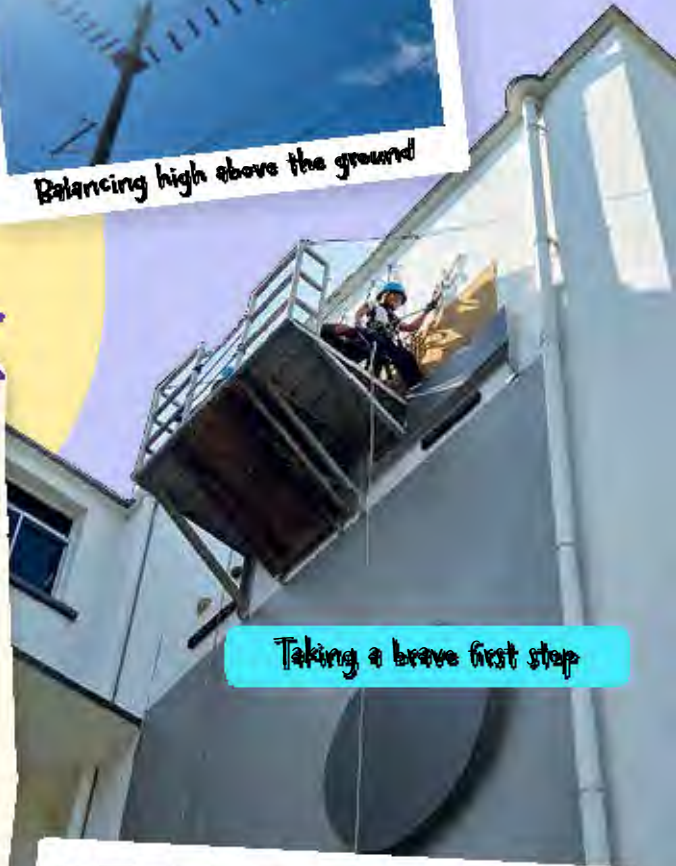
Taking a brave first step

Our Primary 5 adventurers returned with unforgettable memories, stronger friendships, and newfound confidence that will serve them well in their continued educational journey. Well done to all our brave students!