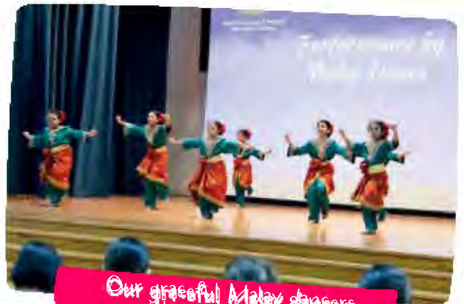
Our graceful Malay dancers closing the event