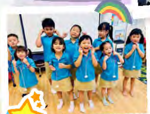
Washing hands, playing doctors