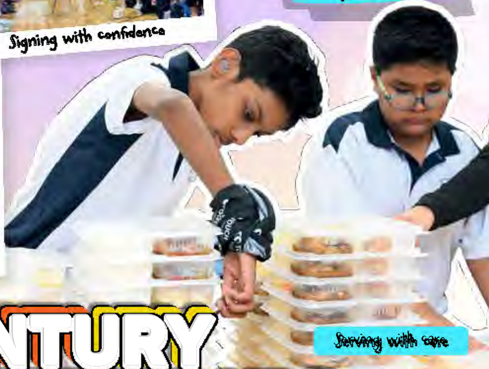
Serving with care