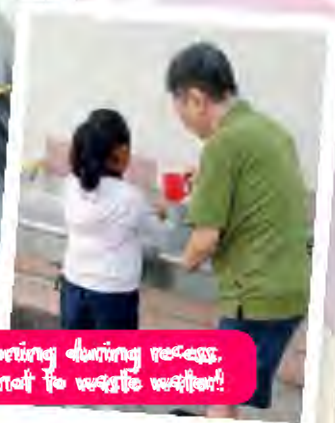
Water rationing during recess. We learnt not to waste water!