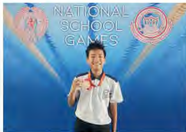
Swimming Medalist (Backstroke)