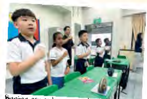
Signing across languages, bridging worlds