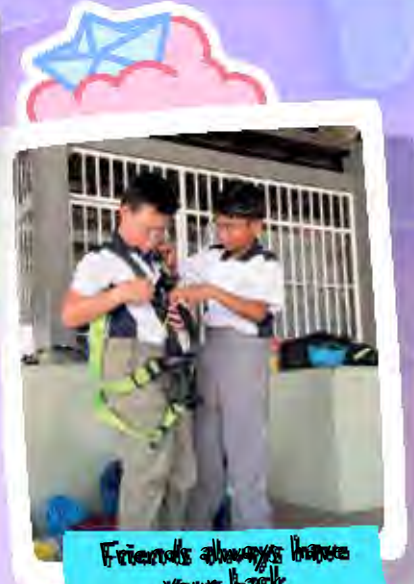
Friends always have your back