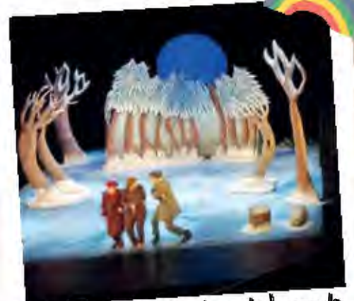
Walking into the deep dark woods