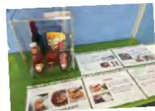
From rice to spices: Discovering ASEAN

A canteen booth was also set up during the week to showcase a variety of condiments and rice dishes commonly found across ASEAN countries. As students explored the booth, they made meaningful connections between cultures, recognising how shared staples such as rice and spices are expressed in unique and diverse ways across the region.