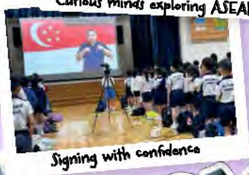
Signing with confidence