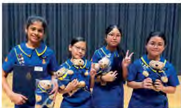
Junior Brigadier Brooch Awardees