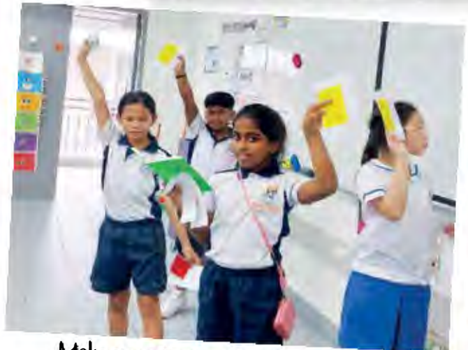
Make meanings with coloured cards

English lessons and is conducted as weekly one-and-a-half-hour sessions.