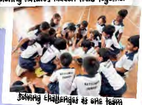
Solving challenges as one team