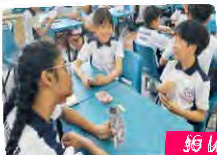
IG Unite! 2.8 card game during a social studies lesson