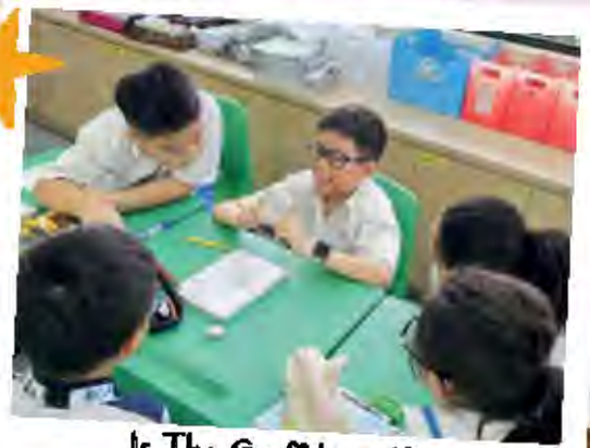
Is The Gruffalo real?