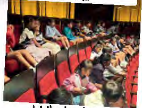
Let the show begin!