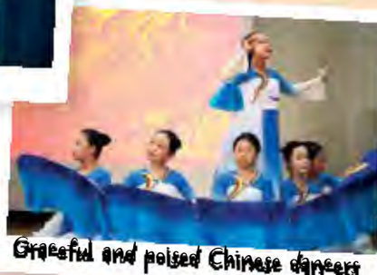
Graceful and poised Chinese dancers