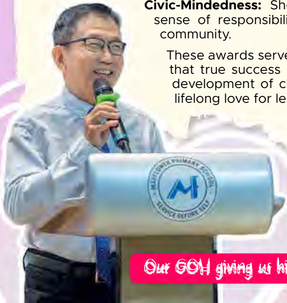
Our GOH giving us his lively speech

To our award winners: continue to stay curious and compassionate. To our partners and parents: thank you for being the pillars of our success.