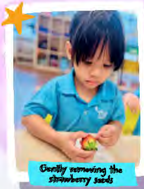
Gently removing the strawberry seeds