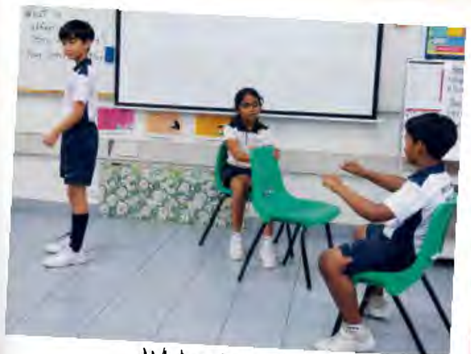
We love Drama!