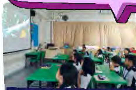
Brr...it's cold, Gruffalo's Child