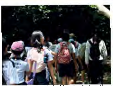
Exploring nature's hidden trails together