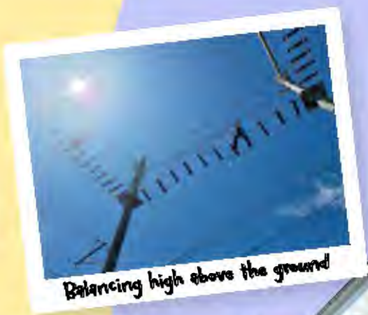
Balancing high above the ground