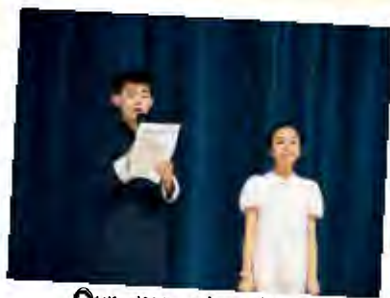
Our ensembles in action