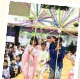
A rhythmic start to IFD Celebration!