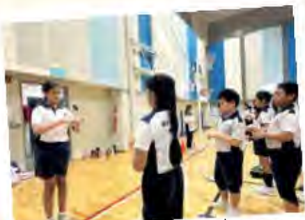
Leading the pledge in sign language

Beyond learning new skills, our students are developing empathy, respect, and a deeper sense of belonging. At MFPS, we remain committed to providing meaningful and inclusive learning experiences, nurturing students who are confident, caring, and ready to connect with others.