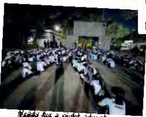
Ready for a night adventure