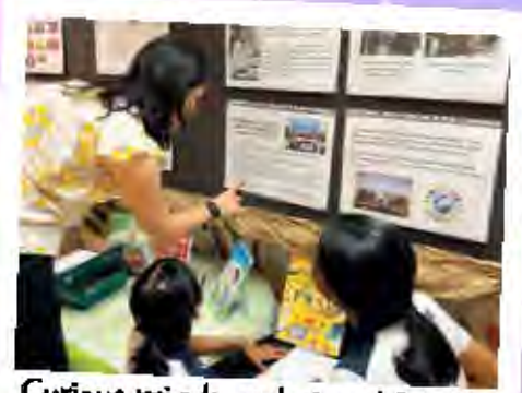
Curious minds exploring ASEAN