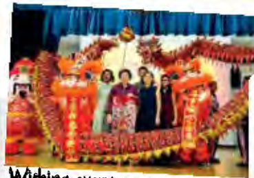
Wishing everyone a prosperous New Year