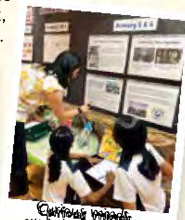
Curious minds exploring ASEAN

As we reflect on this year's theme, Singapore: Forging Friendships in a Complex World, we are reminded that understanding, respect and openness are key to building strong relationships. We hope our students will continue to carry these lessons with them as they forge friendships and contribute positively in a complex and ever-changing world.