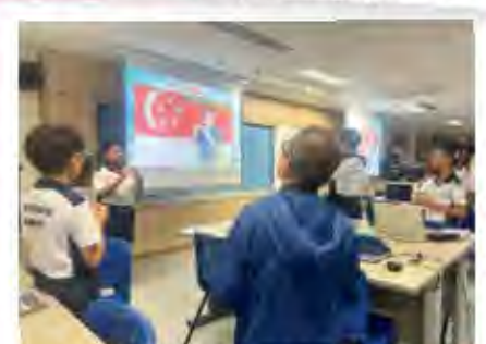
This is what equality looks like