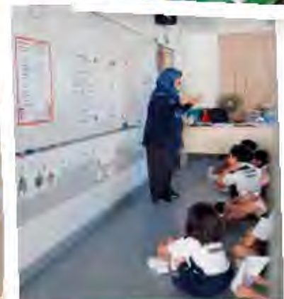
Exemplifying resilience and staying focused during ESR