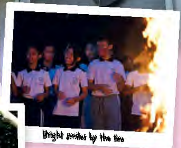
Bright smiles by the fire